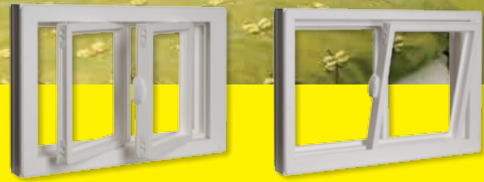
Double Slider Tilt Single Slider Drop Tilt

This classic economical choice offers updated styling, performance, egress, versatility and ease of cleaning.