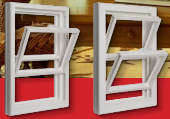
Single Hung Double Hung

Traditional hung windows with an updated matching series design. This style provides the greatest ease of cleaning .